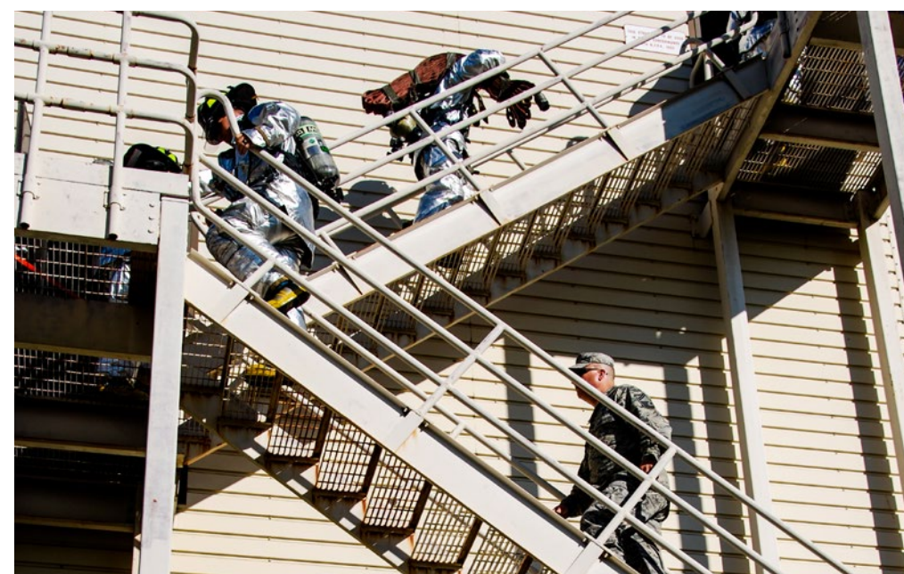
Firefighters and 507th Air Refueling Wing Reservists climb the outside of the fire tower during the 5th annual fire climb Sept. 7 here. Reservists from the CES and 507th climbed up and down the equivalent of 110 stories to commemorate the 343 firefighters, emergency medical technicians and paramedics who lost their lives during the 9/11 attacks on the World Trade Centers.