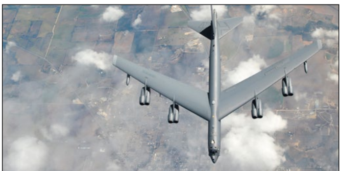
A B-52 Stratofortress descends 500 feet after a training disconnect from a KC-135R refueling boom at 27,000 feet over the skies of Texas.