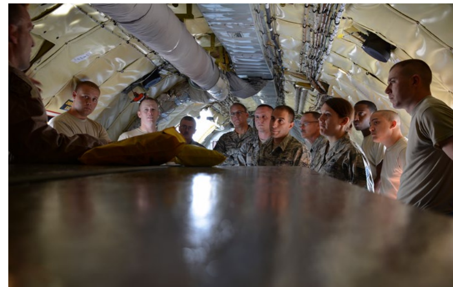
Members from the 507th Air Refueling Wing receive a safety briefing as they prepare to deploy to Southwest Asia. The safety brief is required prior to takeoff for all members flying aboard the KC-135R Stratotanker. The 35 Airmen are deploying in support of Operation Enduring Freedom.