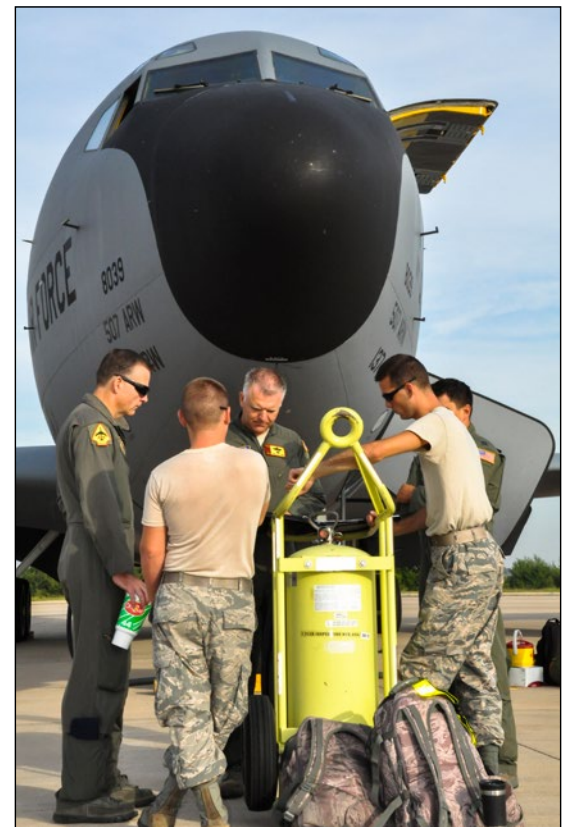
465th Air Refueling Squadron aircrew and maintenance crew chiefs from the 137th Air Refueling Wing, Oklahoma Air National Guard, go through the aircraft forms during pre-flight here Aug. 17.